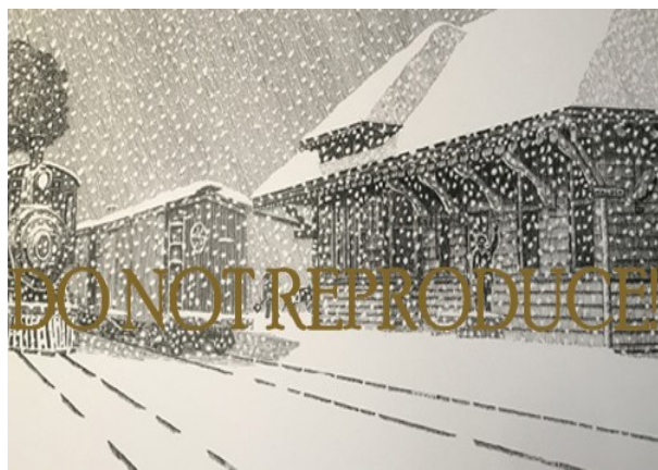
~Walden Station (2 available)