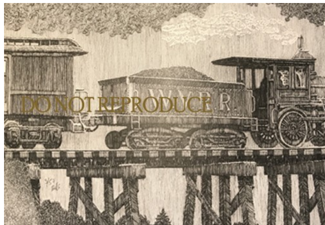
~Montgomery Railroad (3 available)