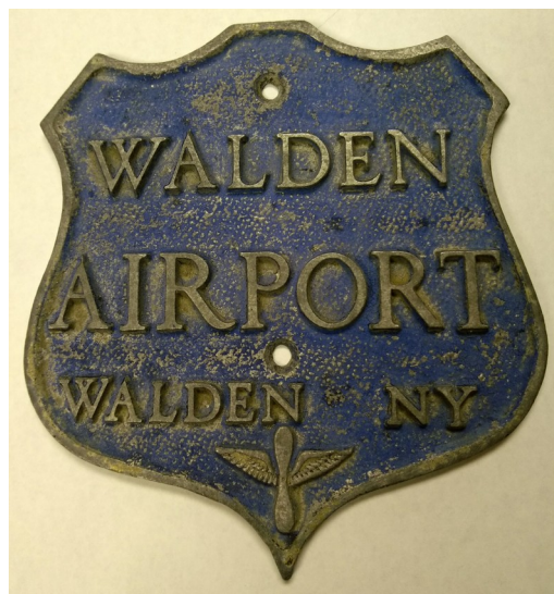
~Plaque from the Walden Airport

None of our current trustees had seen one like this before. The Walden Airport, later called the Newburgh-Walden Airport, was located near Routes 208 and 17K, first opened on Memorial Day 1931 and remained open until June 30, 1960.