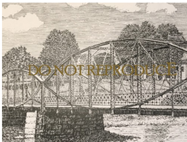
~Iron Bridge, Montgomery (3 available)