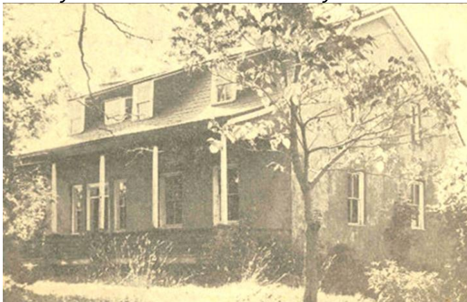
Below: As the house appeared in 1958 (covered in stucco) when purchased by the newly formed Historical Society & in 2018.

The first major repair after the purchase was a new shake shingle roof. Later on, once the stucco was removed from the entire exterior, the beautiful stone walls we see today were revealed.